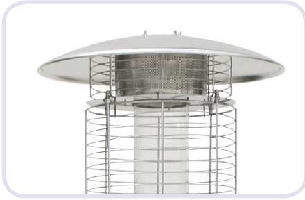
Reflector and upper protective mesh