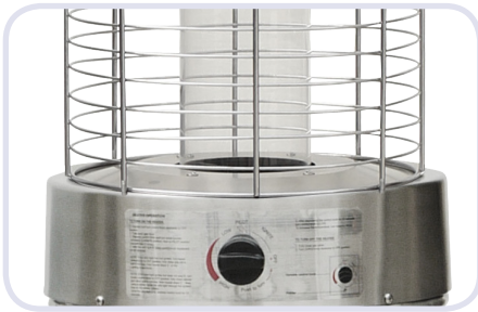
Glass tube & protective guard